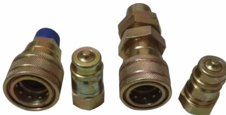
Agriculture Quick Release Coupling Size : 1/2 to 1/2

Scientific, electric, photographical measuring, apparatus for recording transmission reproduction of sound or images data processing equipment computers.