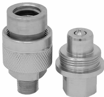
High Pressure Screw Coupling (Popet Type Coupling) Size : 1/4 to 1