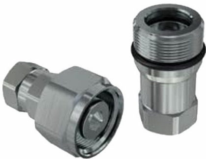
High Pressure Screw Coupling (Popet Type Female Coupling) Size : 1/4 to 1