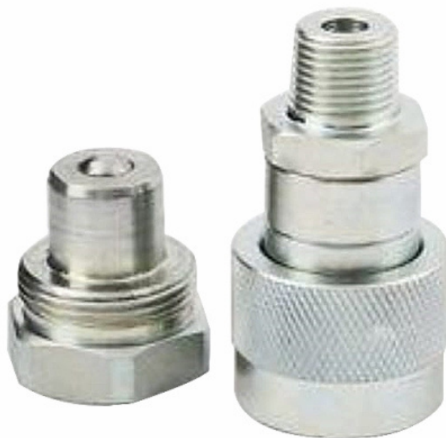
High Pressure Screw Coupling (Bolt Type Male Coupling) Size : 1/4 to 1

Scientific, electric, photographical measuring, apparatus for recording transmission reproduction of sound or images data processing equipment computers.