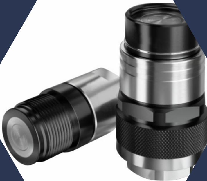
Pressure Flat Phase Cou

Mfg. & Suppliers of all type of silicone tube, braided tube, sleeve, strips, inflatable gaskets , cord, o ring etc.