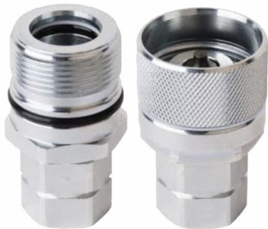
High Pressure Screw Coupling (Popet Type) Size : 1/4 to 1

Scientific, electric, photographical measuring, apparatus for recording transmission reproduction of sound or images data processing equipment computers.