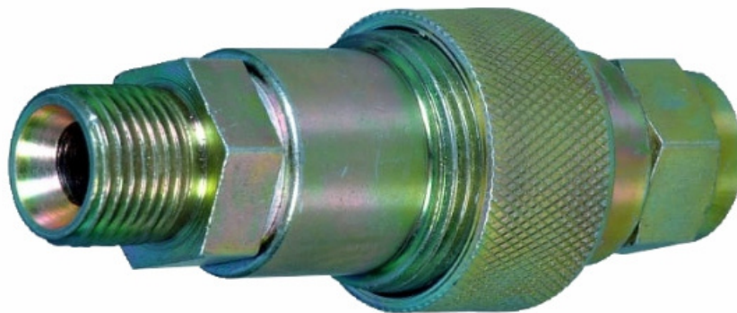
High Pressure Screw Type Coupling (Bolt Type Coupling) Size : 1/4 to 1

Scientific, electric, photographical measuring, apparatus for recording transmission reproduction of sound or images data processing equipment computers.