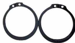
Agriculture Quick Release Coupling Size : 1/2 to 3/8