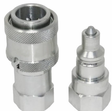
High Pressure Screw Coupling (Popet Type Coupling) Size : 1/4 to 1