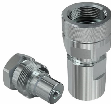
High Pressure Screw Coupling (Popet Type) Size : 1/4 to 1