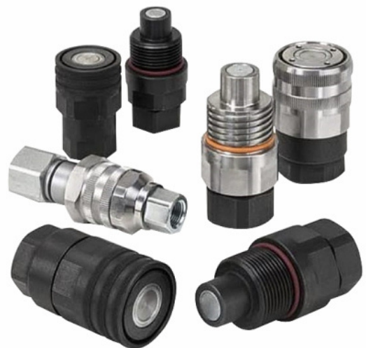
High Pressure Flat Phase Coupling Size : 1/4 to 1