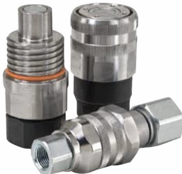
High Pressure Flat Phase Screw Coupling Size : 1/4 to 1

Scientific, electric, photographical measuring, apparatus for recording transmission reproduction of sound or images data processing equipment computers.