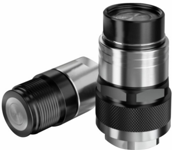
High Pressure Flat Phase Coupling Size : 1/4 to 1

Scientific, electric, photographical measuring, apparatus for recording transmission reproduction of sound or images data processing equipment computers.