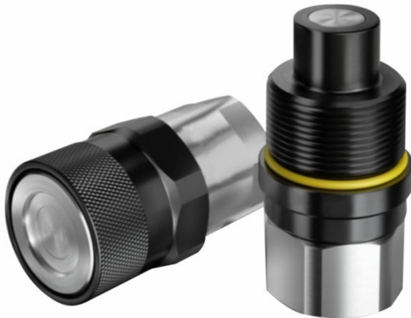
High Pressure Screw Type Coupling Size : 1/4 to 1

Scientific, electric, photographical measuring, apparatus for recording transmission reproduction of sound or images data processing equipment computers.