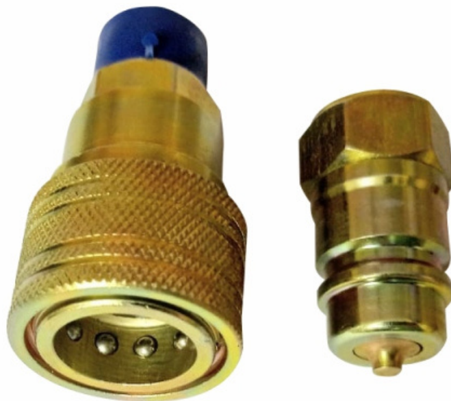
Agriculture Quick Release Coupling Size : 1/2 to 1

Scientific, electric, photographical measuring, apparatus for recording transmission reproduction of sound or images data processing equipment computers.