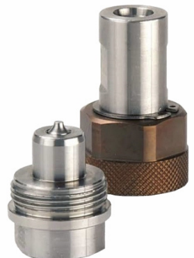
High Pressure Screw Coupling (Popet Type Female Coupling) Size : 1/4 to 1