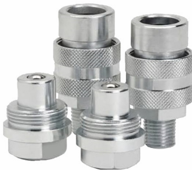
High Pressure Screw Coupling (Bolt Type Coupling) Size : 1/4 to 1

Scientific, electric, photographical measuring, apparatus for recording transmission reproduction of sound or images data processing equipment computers.