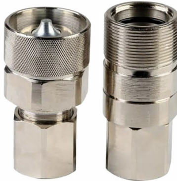
High Pressure Screw Coupling (Popet Type Female Coupling) Size : 1/4 to 1

Scientific, electric, photographical measuring, apparatus for recording transmission reproduction of sound or images data processing equipment computers.